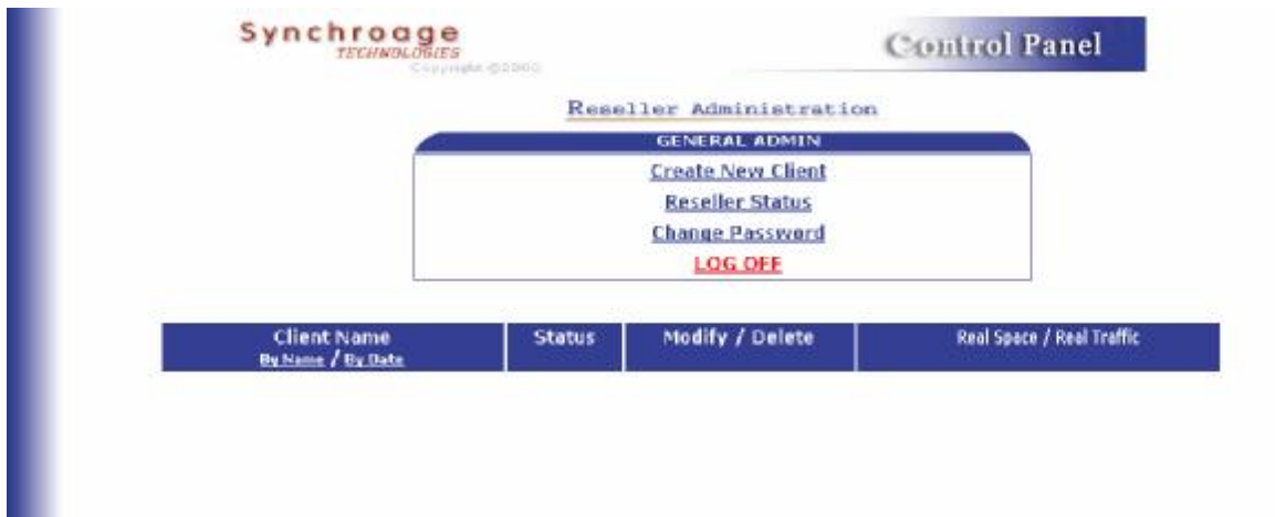
Screen Shot 2

NOTE: It is Very Important to Log Off after managing your Clients. (Security Purpose).