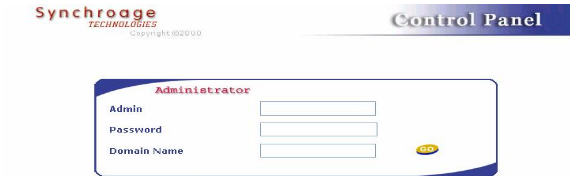
Screen Shot 1

By using the URL (Given By Administrators) you will get the following Screen. (Screen Shot 1)